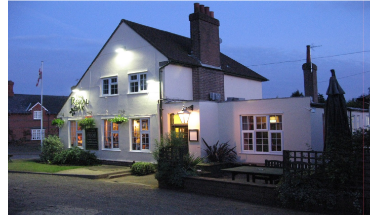
The Royal Oak, Naseby