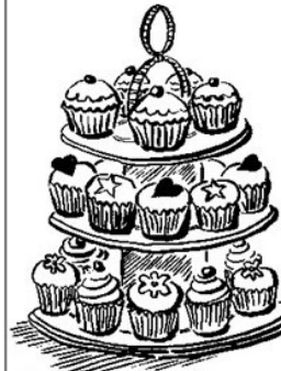
Illustration by Natasha Ledwidge

♥ 8 th June ♥ 6 th July ♥ 7 th September ♥