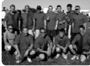
- The Royal Oak Team - One of the top four teams!

This was the second year of this event, and as last year, was a huge success despite all the obstacles we needed to overcome. The event raised about £2500 towards the upkeep and maintenance of our Village Hall which is much needed.