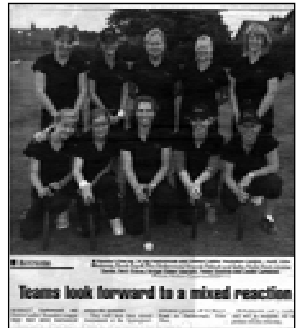
Harborough Mail - August 17th 2006 - Page 61