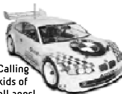
Calling kids of all ages!

Racing will take place on Friday evenings at the village hall from 6.30pm, booking in will start at 7.00pm and racing starts at 7.30pm to 10.15pm (practice from 6.30 to 7.30pm).