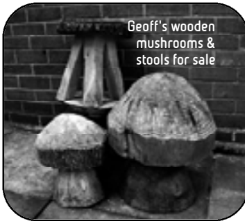
Geoff's wooden mushrooms & stools for sale

Geoff Gould's wooden mushrooms and stools made from cedar, ash, cherry and conifer. He can also make toadstools of different sizes. These make good garden ornaments and can be treated with preservative if desired - every bit of money from the sale of the mushrooms will go