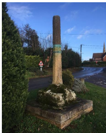
Plate 3: Photograph of the Whipping Cross taken in 2021.

In 1993, the Whipping cross was re-sited to its current position at the junction of Church Street and Gynwell, outside the Methodist Chapel (see Plate 3).