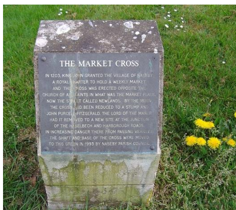
Plate 4. A plaque nearby calls it the 'Market Cross,' and says that 'over time it was reduced to a stump.'

Plate 3: Photograph of the Whipping Cross taken in 2021.