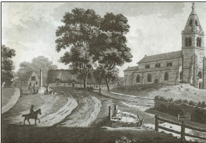
Plate 1: Naseby About 1790 is depicted in this engraving by Samuel Ireland. It shows the spring from which the River Avon rises (now in the garden of Manor Farm), the Parish Church and the medieval marketplace and market cross (whipping cross) in Newland.

The Grade II Listed Whipping Cross was constructed during the 15th century out of limestone and comprises a round shaft set into a square plinth. There is no evidence of securing points, so it is not clear if it was utilised as a whipping post. It is thought to have been from the old market cross (see Plate 1).