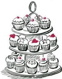
Illustration by Natacha Ledwidge