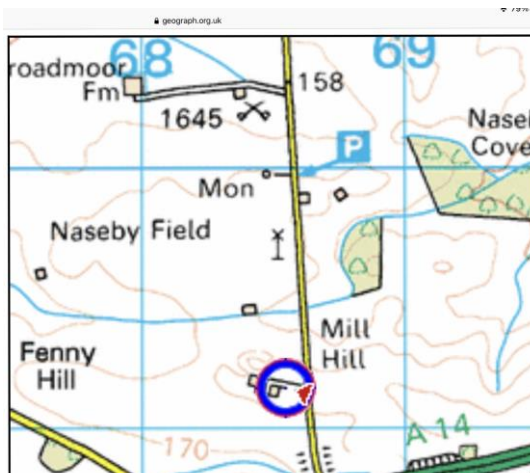
Pressure Reduction Unit

The length of water pipe from Mill Hill Farm to the Sibbertoft Service reservoir is being promoted for replacement (approx. 5,000 metres), but it is highly unlikely this will be considered within the current Anglian Water business period ending in 2025.