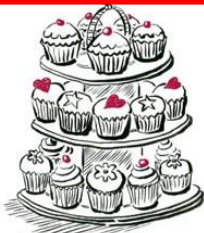
Illustration by Natacha Ledwidge

We are always looking for donations of yummy cakes or a hand setting up or packing away, so if you are able, please join us! If you want to contact us for further information or offers of help, please contact me on 07525 842831. Any local small businesses who would like to sell goods at the coffee morning can also contact me.