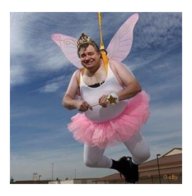
All ages and genders required but especially mature men who have lost all inhibitions

Actors of all abilities required for our next pantomime, no experience needed just a willingness to have a lot of fun and make lots of new friends.